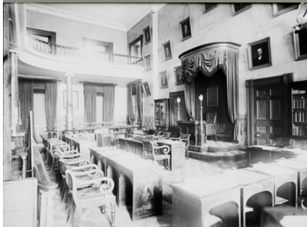
Interior Chamber 1899 - these are the same chairs used in today's chamber